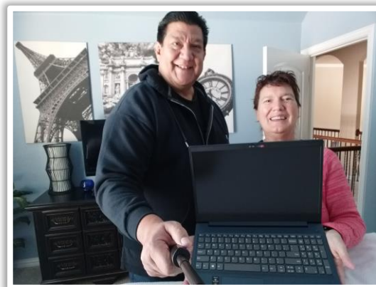
Our thanks to the gang at St. Paul's, Owasso OK, for providing this needed gear for SGSP Aviation Ministries in Quetzaltenango, Guatemala.

Our ministry computer first began slowing down noticeably, then locked screens, and then surprise power downs became regular. In November last year, after pressing the power button, the old computer gave off an audible groan, then a puff of smoke, and it was all over. Publications, social media, and most critically ministry administration ground to a halt. Today we are back in business with a new computer.