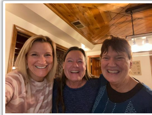
Special treat, family reunion, Twin Peaks CA.

Missionary life is always an adventure. Like the erupting volcanos threatening to close commercial air travel the day we departed Guatemala or landing in the Arctic blast that paralyzed Dallas and surrounding areas, cutting power and water for days...but that's a story for another day.