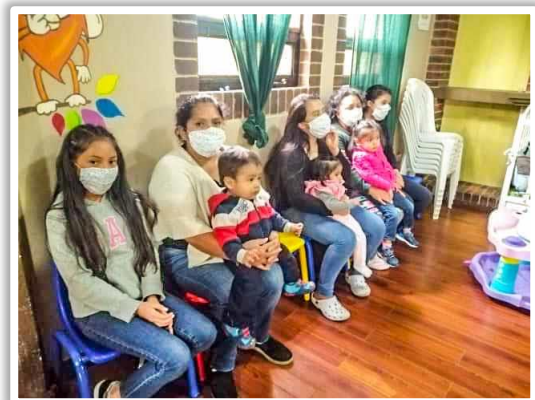
Children’s home staff observing preventive protocols.

Just what the doctor ordered! Staff at a nearby children’s home (Hogar Prometido), mask up to protect those they are caring for. For two weeks and counting, the nursing staff that would normally shift in and out, are now living at the Hogar so as not to introduce outside pathogens to the children inside the compound.