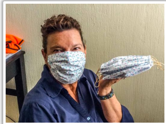
Who is that Masked Missionary?