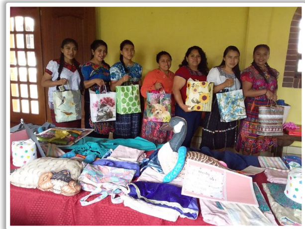
The tireless staff of Hogar Prometido, Quetzaltenango