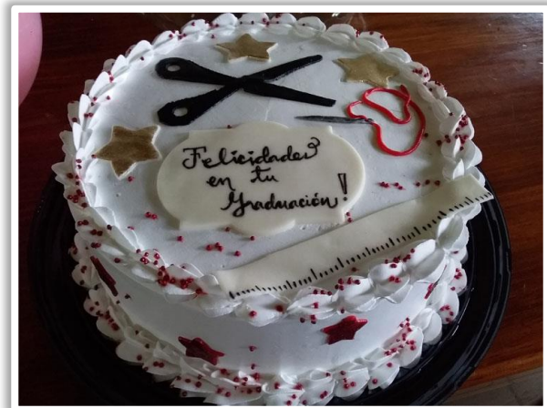
It is not a graduation unless there's cake!

In the rural Mayen culture, accomplishments are occasions to celebrate with speeches, testimonies, certificates, hugs, and gift-giving. If it were not for YKW restrictions, entire extended families would be in attendance.