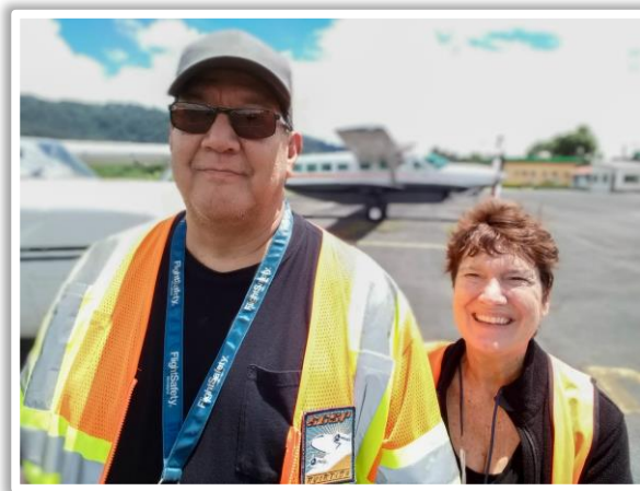
Let go and let God! The possibilities are limitless.