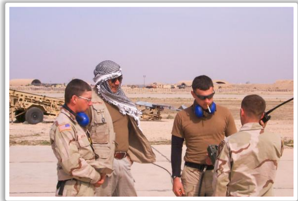
From August 2002. Not yet a year after the attacks of September 11, 2001. Many found themselves in unexpected places, doing unexpected things.

As missionaries in Guatemala these past 15 years, our job is not so different as with those soldiers. First, we introduce people to God’s plan of salvation through Jesus Christ. Secondly, by personal example and even formal training, they become certified in God’s Word. Finally, we maintain our place in the country and community to cheer them on to continued growth as followers of Christ. --Could there be a missionary calling on your life? SGSP Aviation Ministries is looking for Stateside volunteers to work in administration, communication, and coordination. If you have ever thought about using your pilot/A&P skills on the mission field, we should talk.