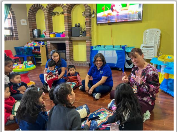
Plush books and Bible teaching....